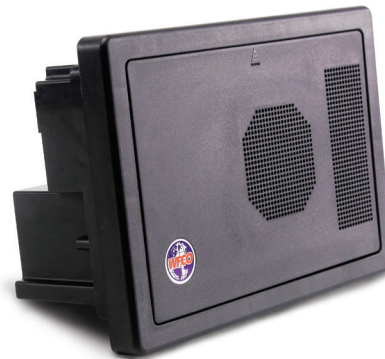
WF-8700 Series 35/40 Amps Zero Clearance Design

Model WF-8712 Output: 12 Amps DC Input: 105-130 VAC, 60 Hz, 210W